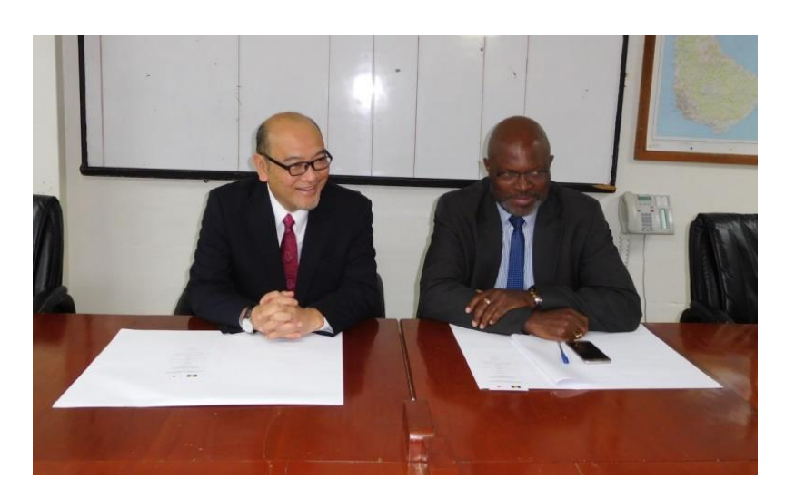
Ambassador Shinada and Minister Brathwaite